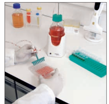
Removal of washing solutions