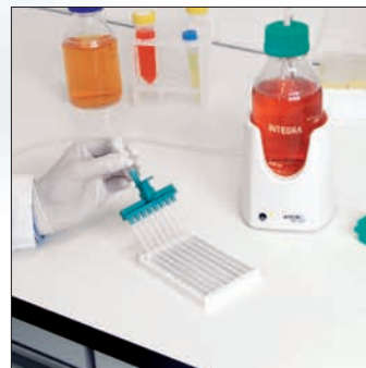
Aspiration from Western blot strips