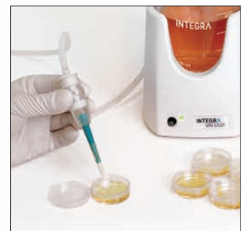
Removal of culture media