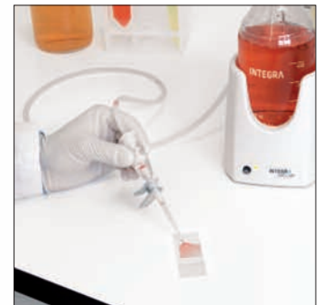
Removal of excess liquid from object slides