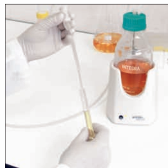
Supernatant removal to harvest bacteria