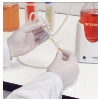
Aspiration of supernatants